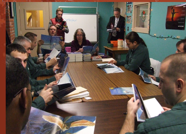
Connections participants in a Family Connections Center series at the New Hampshire State Prison in Concord.

" Connections gave us a creative connection to our children."