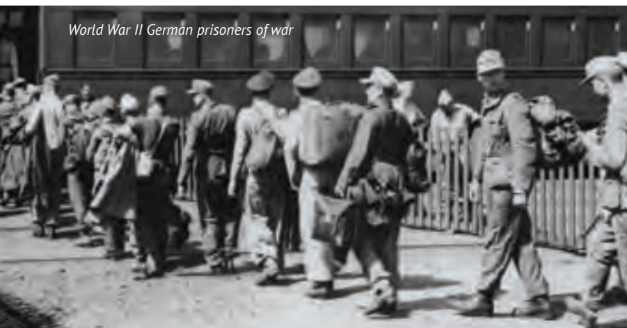
World War II German prisoners of war